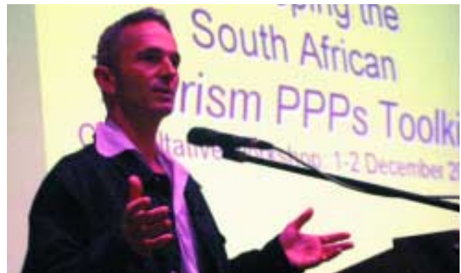
Dr Crispian Olver, Director-General Department of Environmental Affairs & Tourism, opening the December 2004 workshop.

“Drawing on many salient lessons from early tourism PPP deals, this Toolkit is being designed to bring certainty, transparency, procedural efficiency and fairness in the tourism PPP market, enabling relevant government institutions to make PPPs part of their normal work, and enabling big and small