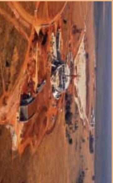
Maropeng under construction, August 2005.

Six years ago a unique World Heritage Site was declared by United Nations Educational, Scientific and Cultural Organisation (UNESCO) in the dusty lands north-west of Johannesburg, South Africa, where Wits University's paleontologists have been unearthing ancient human ancestry for decades.