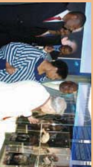
Professor Philip Tobias (foreground) shows the skull of 'Mrs Ples' to Deputy President Phumzile Mlambo-Ngcuka, Gauteng Premier Mbazana Shilowa, Gauteng Finance MEC Paul Mashatile, and Arts and Culture Minister Pello Jordan at the opening of the Sterkfontein Caves visitor centre on 29 September 2005.

Visit www.discover-yourself.co.za to find out more.